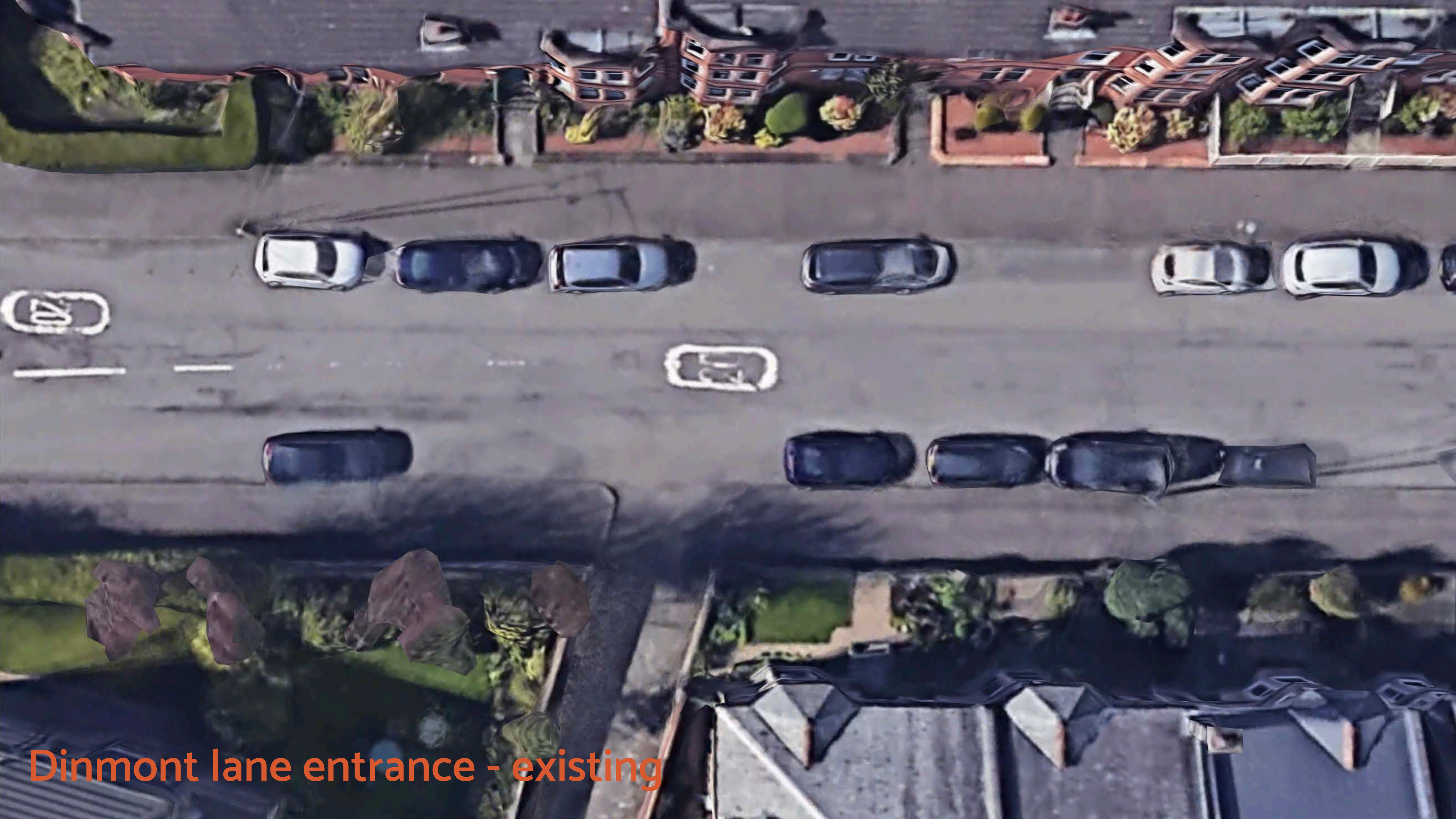
Dinmont lane entrance - existing