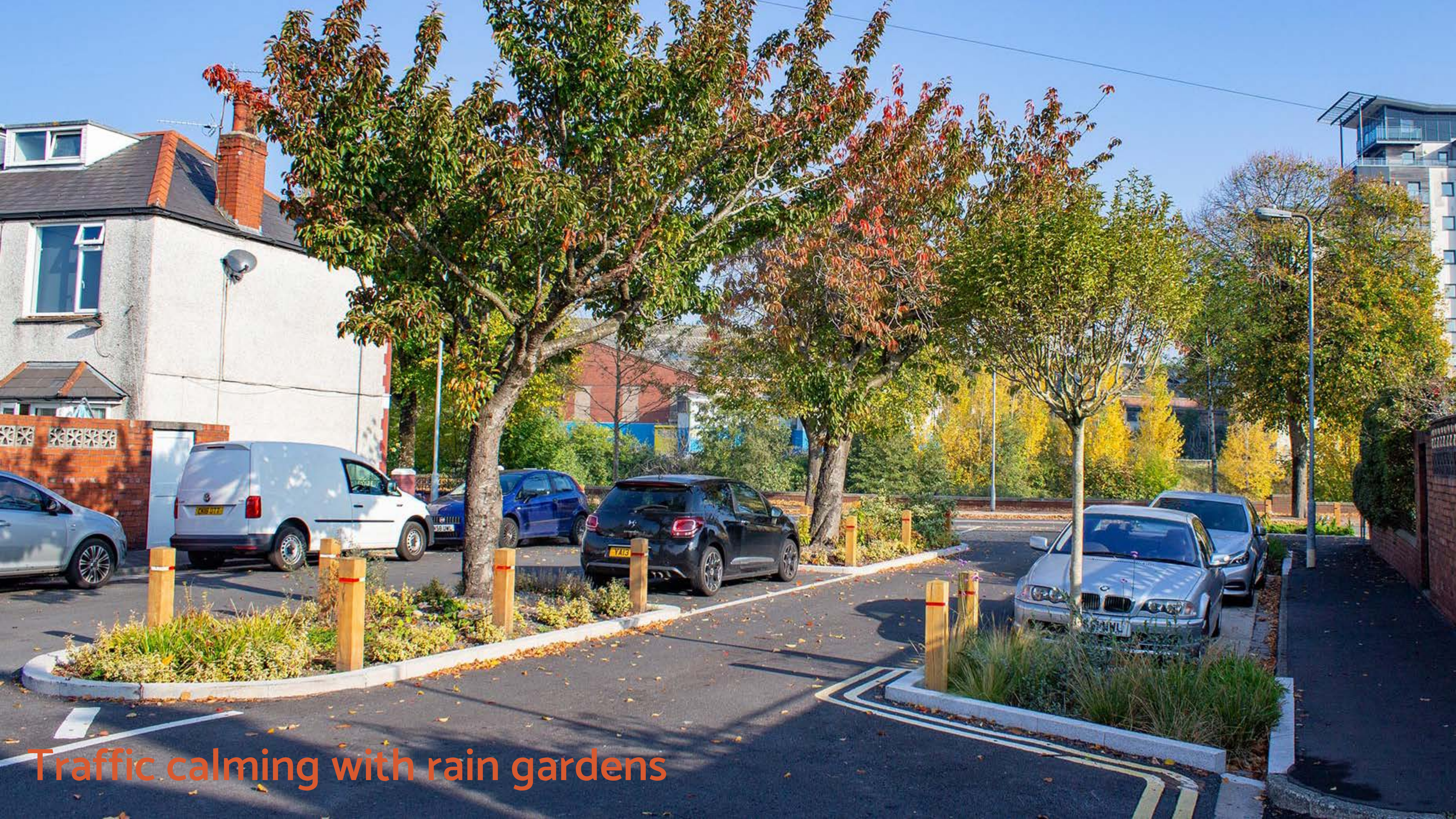
Traffic calming with rain gardens